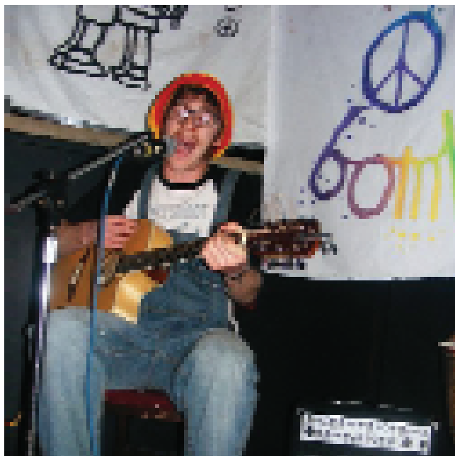
Left: A performer at a club night organised by CAAT supporters in Nottingham