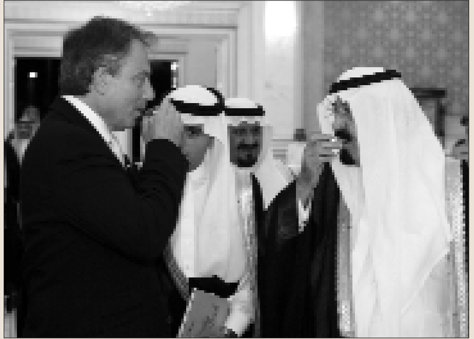
Tony Blair and Crown Prince (now King) Abdullah at Riyadh Air Base in July 2005

In 1986 and 1988, the UK signed massive arms deals with Saudi Arabia, known as Al Yamamah ('the dove' in Arabic) I and II. The deals revolved around Tornado fighter and ground-attack aircraft, along with associated weaponry, spares and extensive support contracts. Mrs Thatcher and British Aerospace (now BAE Systems) were the main actors on the UK side, but the deals also involved notorious figures such as Jonathan Aitken, Mark Thatcher, Adnan Kashoggi and Wafic Said. The Al Yamamah deals have been the basis of the arms trade relationship between the UK and Saudi Arabia ever since, including